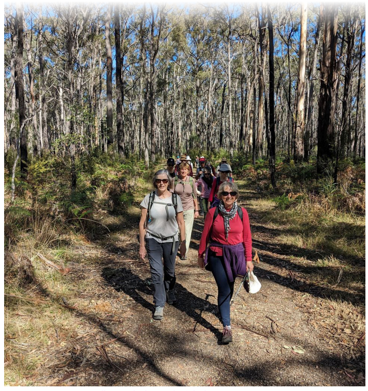
Walkers stride along in the Colquhuon Forest see page /

ISSUE 232 — Newsletter of the Ben Cruachan Walking Club — October 2023