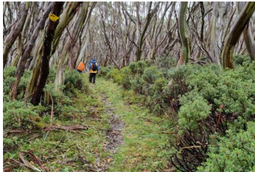
and after track